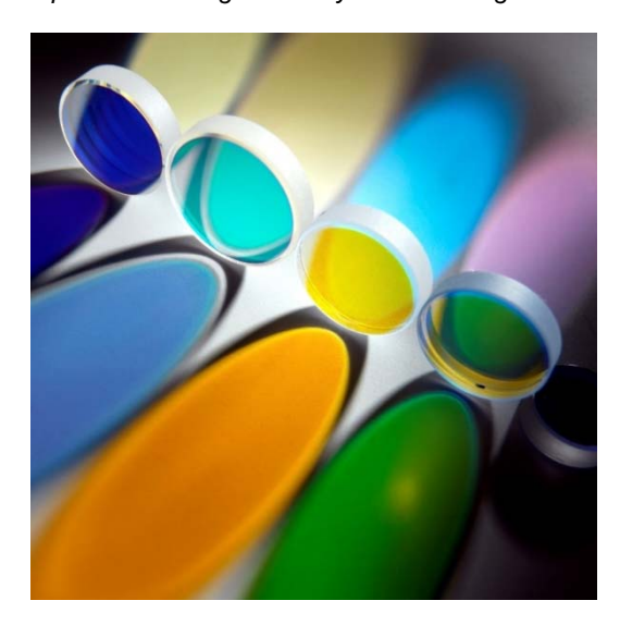
Fig: The high-end, deep blocking excitation and emission filters offered by Optics Balzers

Optics Balzers, a Liechtenstein-based high-tech company, has been the preferred provider of innovative optical coatings and solutions for more than 70 years. Together with its subsidiaries in Jena (Germany) and Penang (Malaysia), Optics Balzers is a global leader in the supply of optical coatings and components. The company focuses on select markets such as Life Sciences, Consumer, Space, Automotive and Lighting. The products and services offered range from optical coatings and glass processing, patterning and bonding technologies, to the manufacture of complete optical sub-assemblies, and are acknowledged as being unique worldwide.